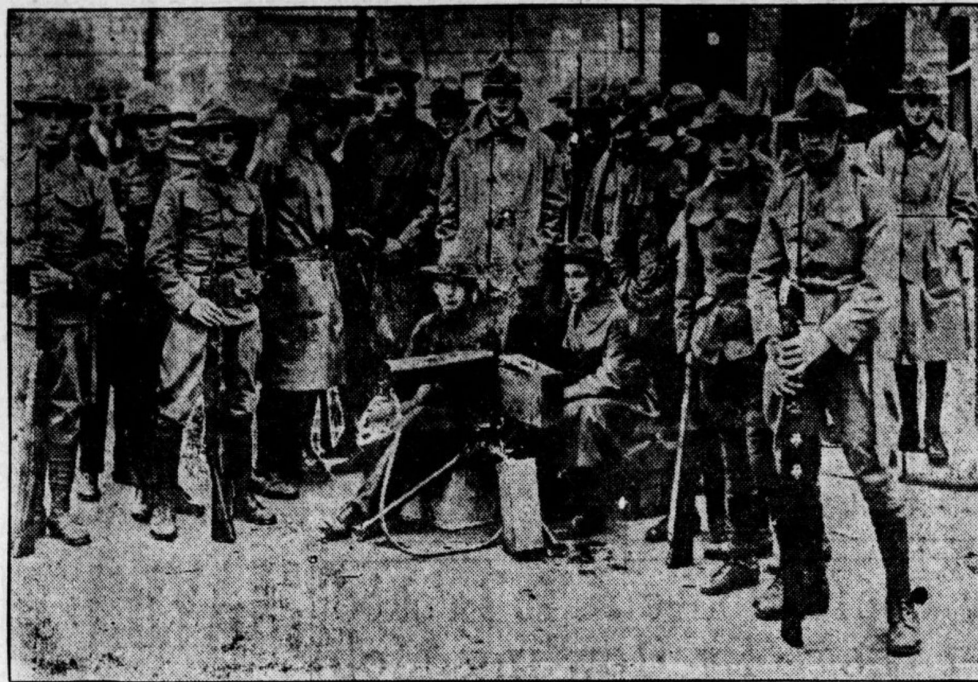
Machine gun stationed at the northeast corner of Twenty-fourth and Lake streets. About 100 soldiers are in the vicinity of this corner.